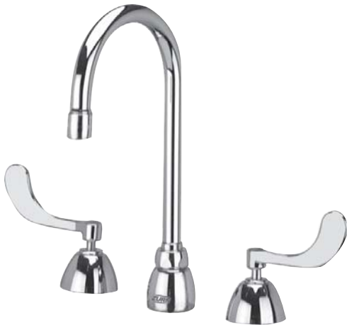
Patented and Patents Pending