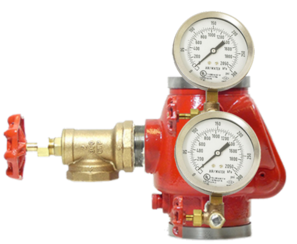
4-F210R Shown with Trim Kit (Sold Separately)