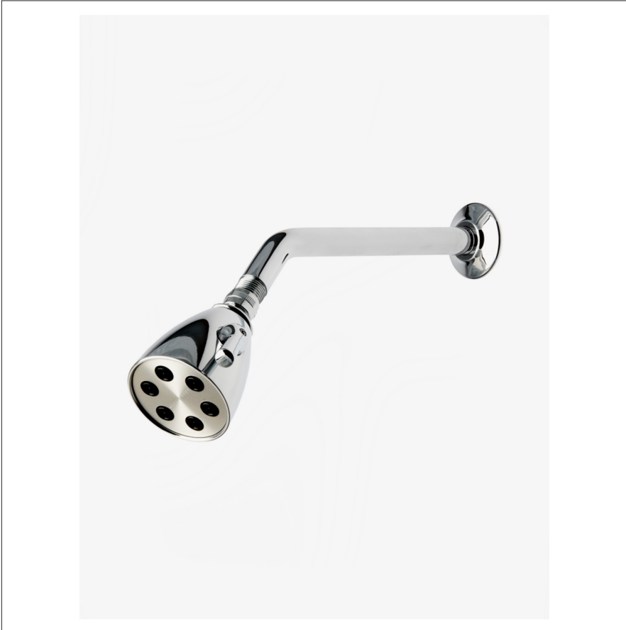
SHOWN IN HIGHGATE WALL MOUNTED SHOWER ARM AND FLANGE | HGSH01