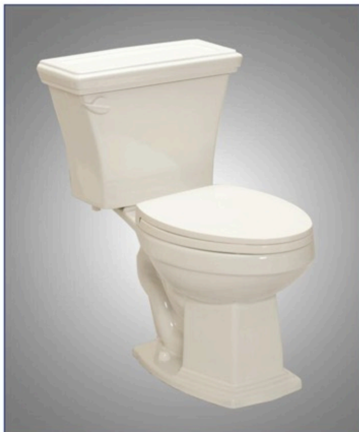
With Western the water savings are significant and maintenance is minimal.

Our customers tell us it's "The Best Flushing Toilet in America!"