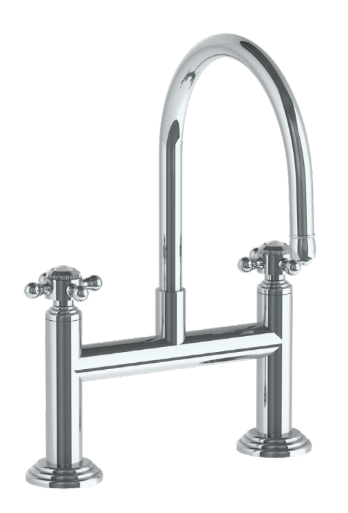
Fits Deck Up To 2" Thick