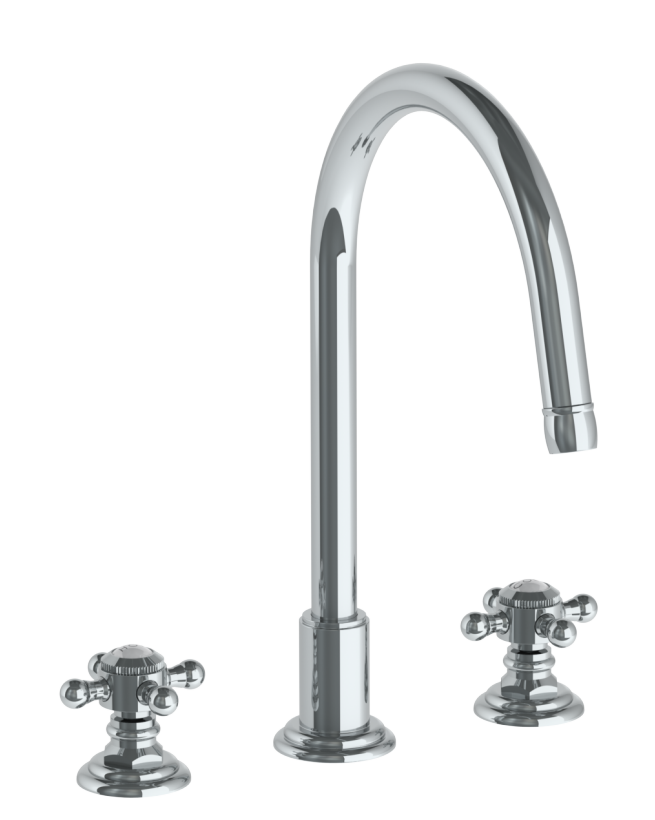
Available in all finishes shown on the Watermark Designs website