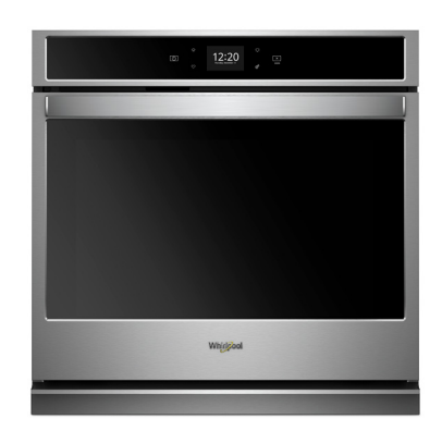
Stainless Steel WOS51EC7HS