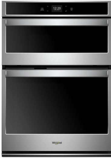
Stainless Steel WOC54EC7HS