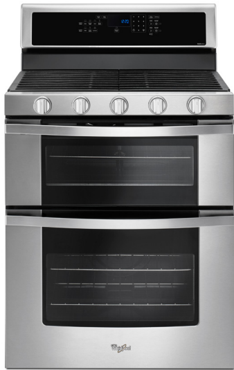
Stainless Steel WGG745S0FS