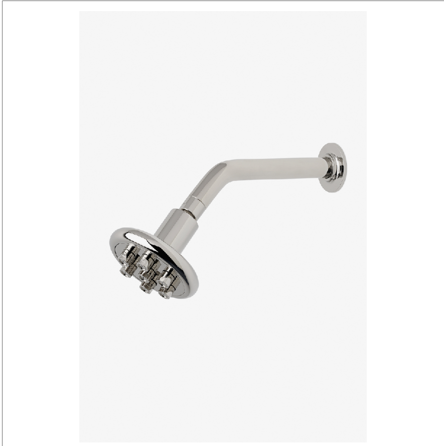
SHOWN IN BOND 4 1/4" SHOWERHEAD WITH 8" WALL MOUNTED 45 DEGREE SHOWER ARM | BNS245

Bond 4 1/4" Showerhead with 8" Wall Mounted 45 Degree Shower Arm