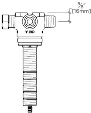
TOP VIEW SCALE: 3"=1'-0"

ViaWorks Two Way Diverter Valve for Pressure Balance Shower Systems