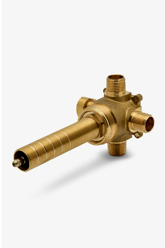
SHOWN IN VIAWORKS TWO WAY DIVERTER VALVE FOR PRESSURE BALANCE SHOWER SYSTEMS | GUDV2P