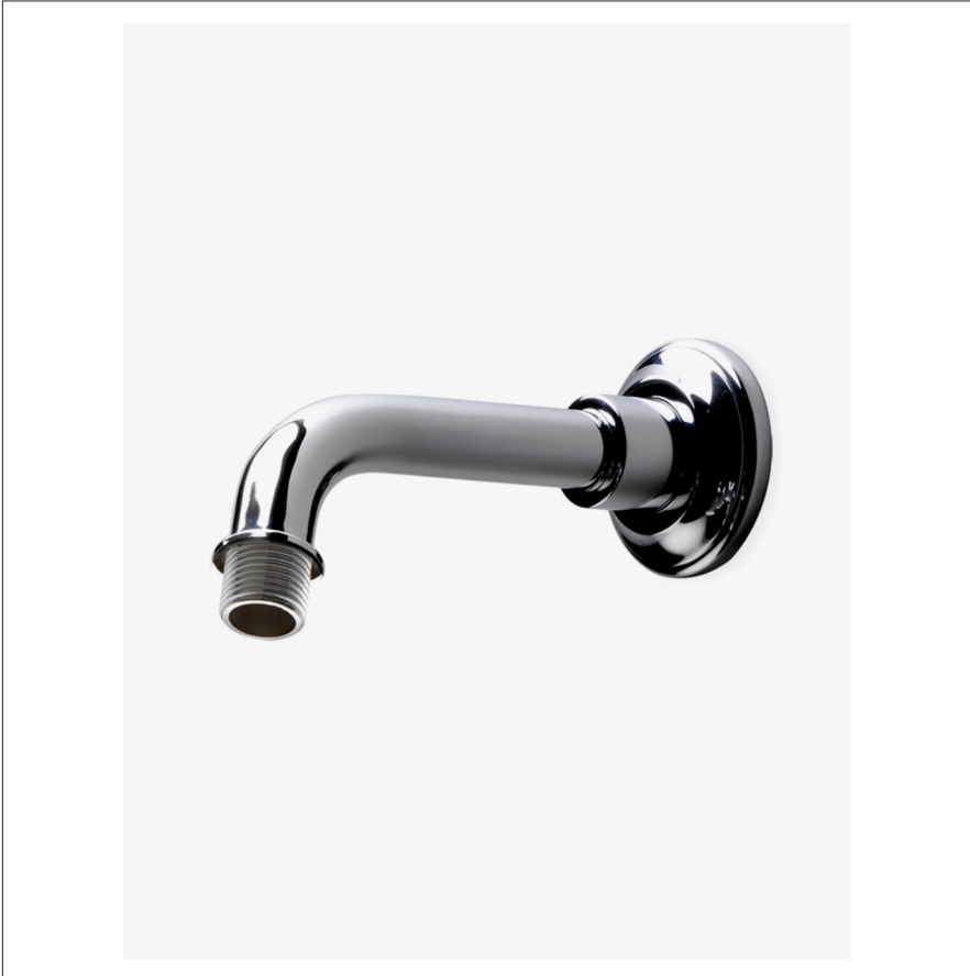
SHOWN IN CHROME