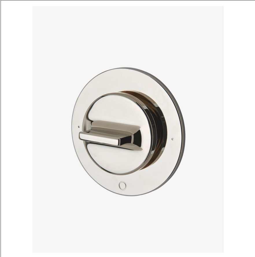
SHOWN IN FORMWORK TWO WAY DIVERTER VALVE TRIM FOR THERMOSTATIC SYSTEM WITH METAL KNOB HANDLE]

Formwork Two Way Diverter Valve Trim for Thermostatic System with Metal Knob Handle