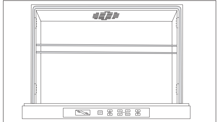
Figure 1: Mounting Rack Assembly with Center Supports

IMPORTANT NOTE: Never leave food in warming drawer for more than four hours.