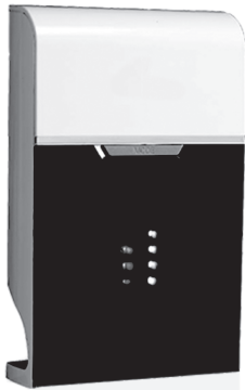
Ozone generator (installs undersink)