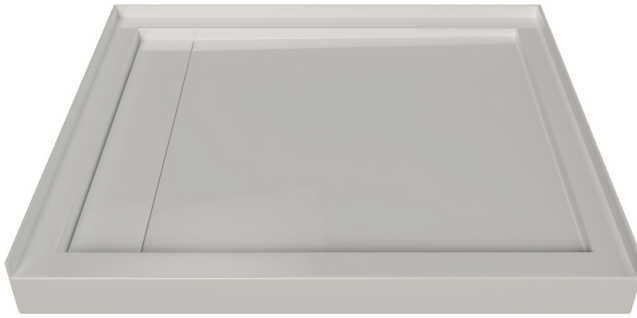
LEFT HAND DRAIN LOCATION SHOWN

Product images are for illustration purposes only. Actual product(s) may vary.