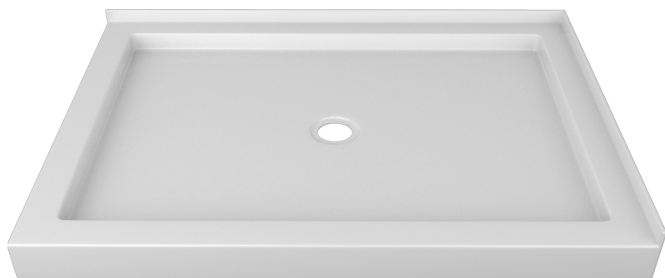
LEFT HAND THRESHOLD LOCATION SHOWN

Product images are for illustration purposes only. Actual product(s) may vary.