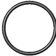
006562-45 O-Ring (4) Supplied