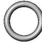
009267-45 O-Ring (2) Supplied