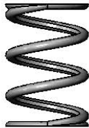
001625-45 Spring (1) Supplied