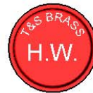
001194-45 Hot Index (1) Supplied