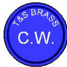
001686-45 Cold Index (1) Supplied