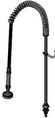
B-0044-H 44" Stainless Steel Flex Hose w/ Polyurethane Inner Hose