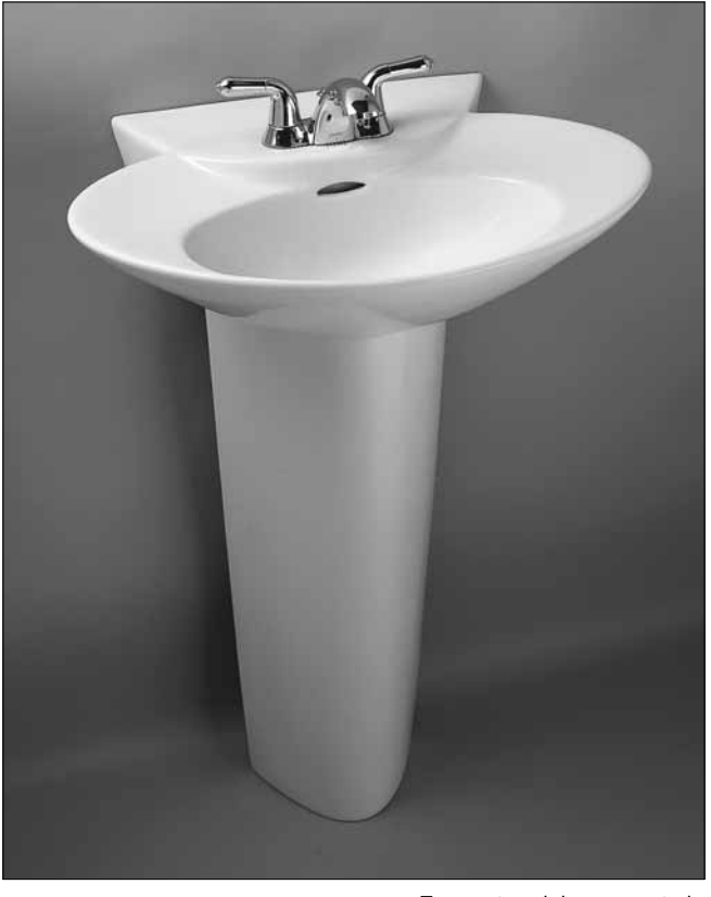
Faucet sold separately