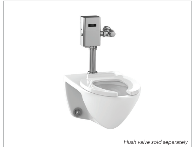
Flush valve sold separately