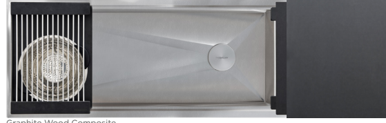
Graphite Wood Composite