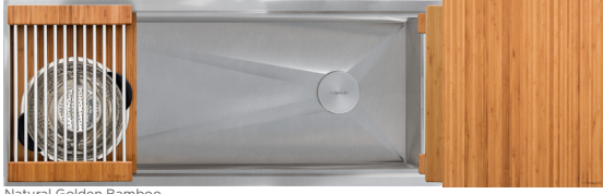
Natural Golden Bamboo