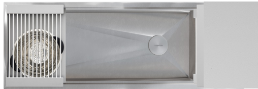
Exclusive Gray Resin*