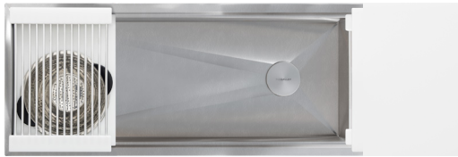
Designer White Resin*