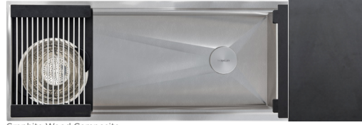
Graphite Wood Composite