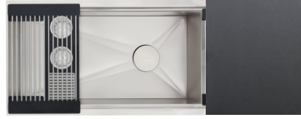
Graphite Wood Composite