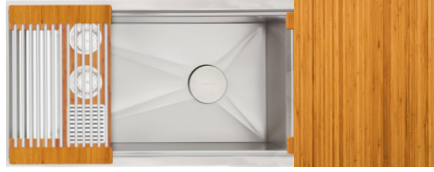
Natural Golden Bamboo