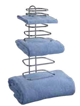
4 GUEST TOWEL HOLDER