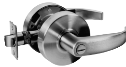
PRIVACY RESTROOM INSIDE TURN BUTTON