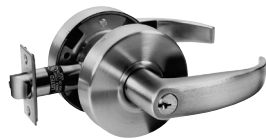
ENTRY ENTRANCE/OFFICE INSIDE TURN BUTTON