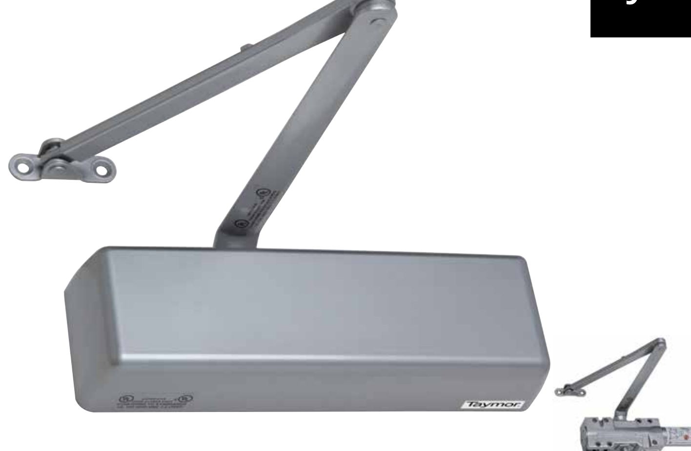
WITHOUT PLASTIC COVER