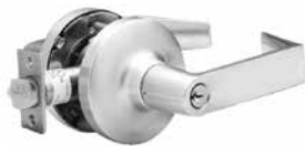
ENTRY ENTRANCE/OFFICE INSIDE TURN BUTTON