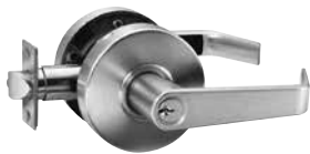
ENTRY ENTRANCE/OFFICE INSIDE TURN BUTTON