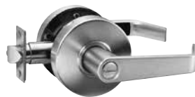
PRIVACY RESTROOM INSIDE TURN BUTTON