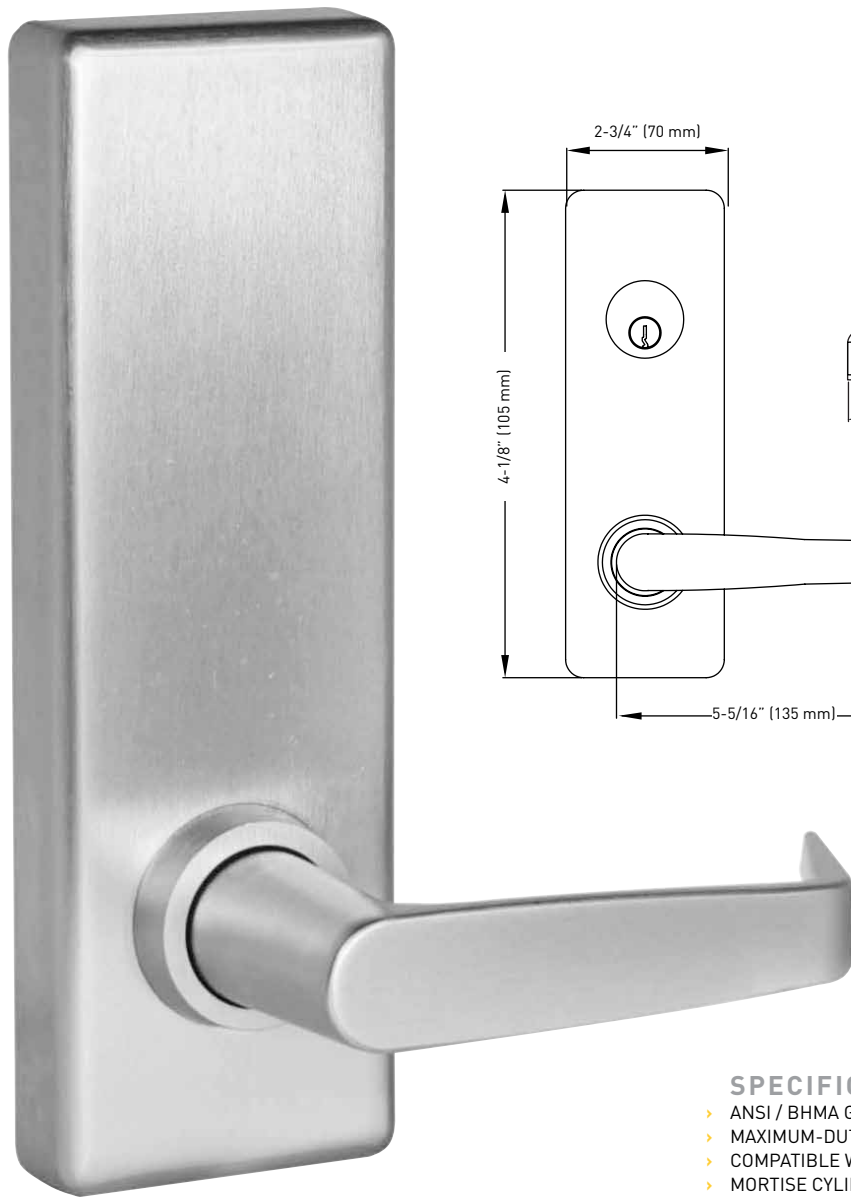
ESCUTCHEON LEVER TRIM