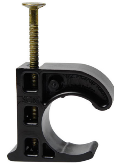
556-2 Patent # 7,207,530