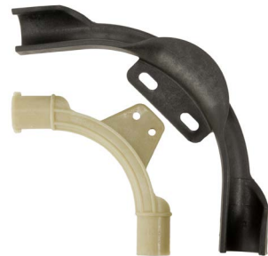
550-PB2 & 550-PB3