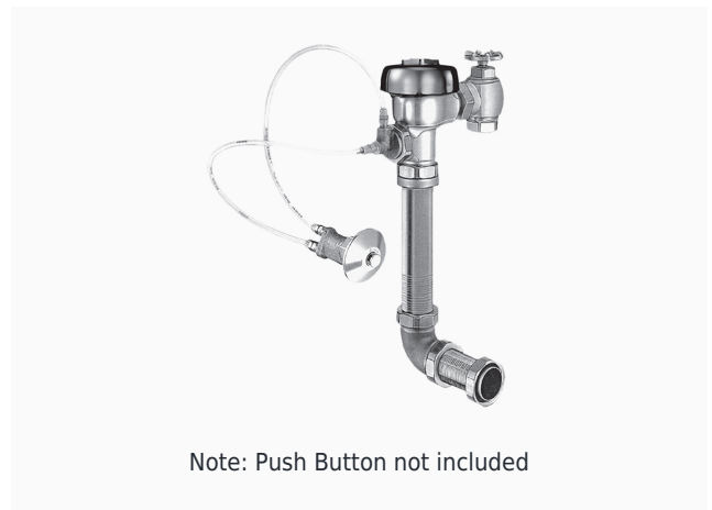
Note: Push Button not included