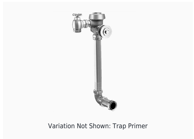
Variation Not Shown: Trap Primer