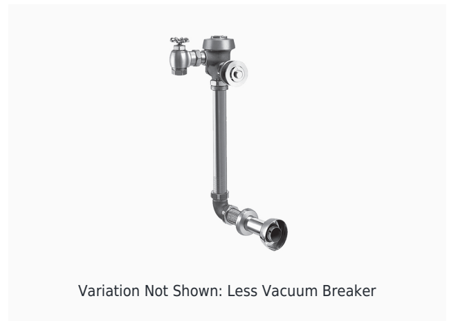
Variation Not Shown: Less Vacuum Breaker