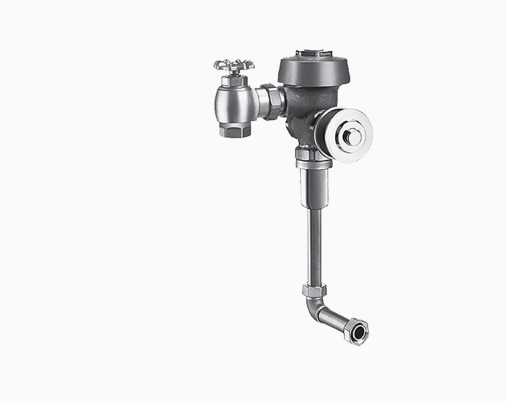
Variations Not Shown: Anti-Flood Device and Metal Button Fixture Wall Actuator