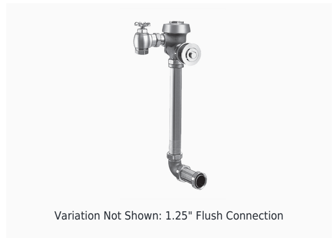
Variation Not Shown: 1.25" Flush Connection