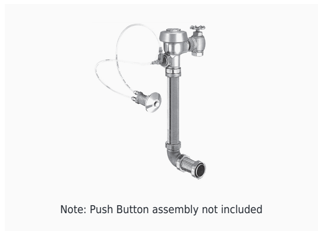
Note: Push Button assembly not included