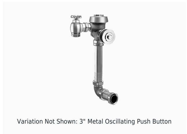
Variation Not Shown: 3" Metal Oscillating Push Button