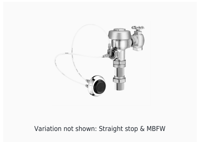
Variation not shown: Straight stop & MBFW