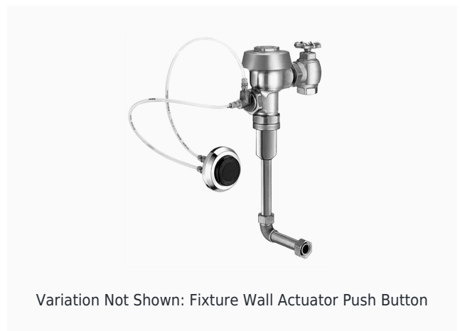
Variation Not Shown: Fixture Wall Actuator Push Button