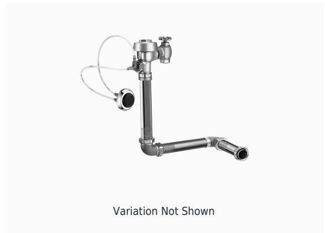
Variation Not Shown