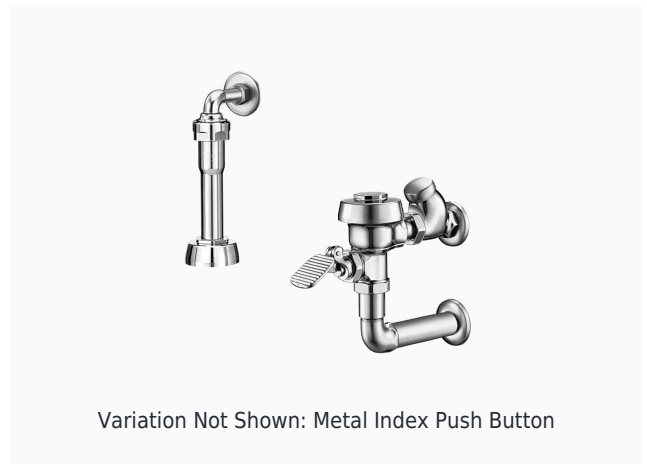
Variation Not Shown: Metal Index Push Button