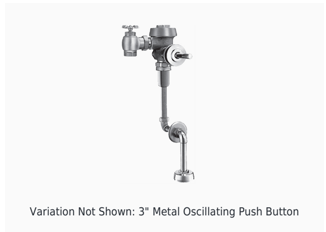
Variation Not Shown: 3" Metal Oscillating Push Button