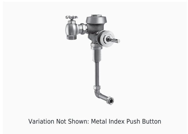
Variation Not Shown: Metal Index Push Button