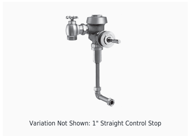
Variation Not Shown: 1" Straight Control Stop