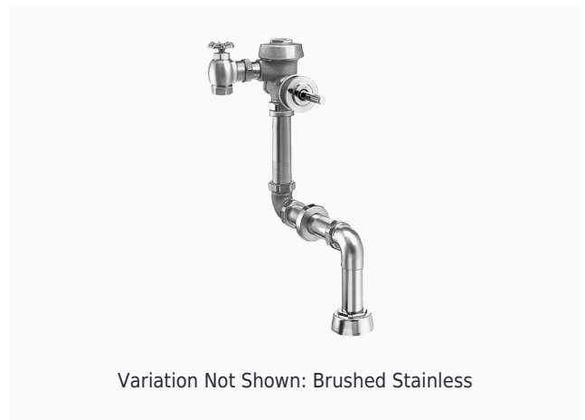
Variation Not Shown: Brushed Stainless