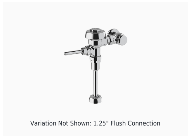
Variation Not Shown: 1.25" Flush Connection