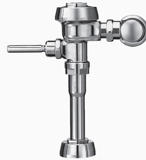
Variation Not Shown: Polished Brass